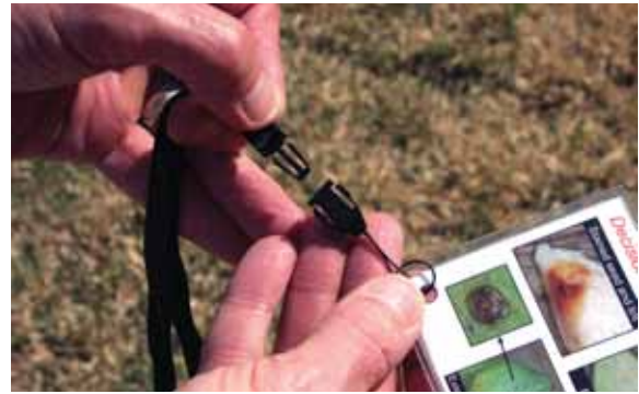
Figure 3. Lanyard with a quick disconnect for removing the aid to measure boll diameter.